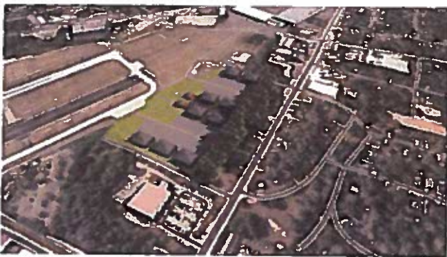
An illustration of proposed hangars at the south end of the PDK Airport runway. (Special)

The airport, which is governed by DeKalb County and located in the city of Chamblee, is near the Brookhaven border. Residents living in nearby neighborhoods, such as Ashford Park, have in the past complained about noise from the airport.